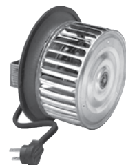
Figure 2B RB24 RB22 RB25 RB26 RB28