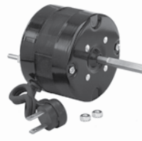
Figure 6 R264 R266