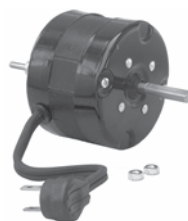
Figure 5 R262 R260 R261 R265 R267