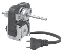
Figure 4 R630