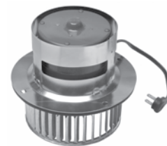
Figure 3B RB30 RB29