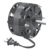
Figure 7 R2605