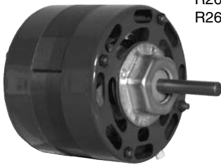
Fig.3 R2657 R2658