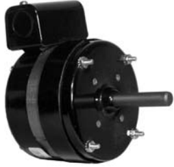
Fig.1 R2609 R2612 R2603 R2602

Sleeve Bearing - Shaded Pole & P.S.C - Single & Double Shaft.