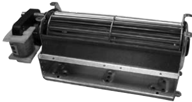
Fig. 4 RB571