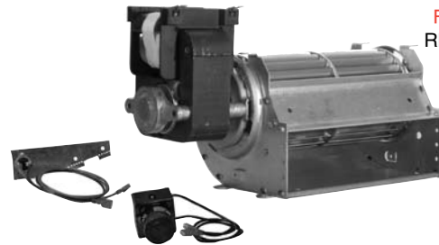
Fig. 9 RB21K