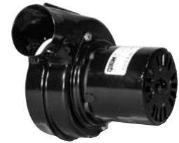
Fig. 3 RB91