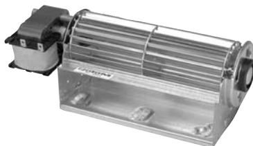
Fig.5 RB86 RB61