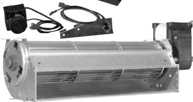
Fig. 10 RB74K