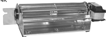
Fig. 11 RB68