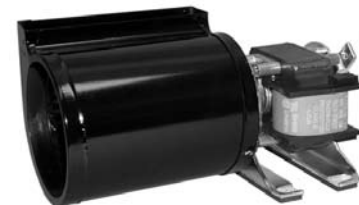
Fig. 11 RB130