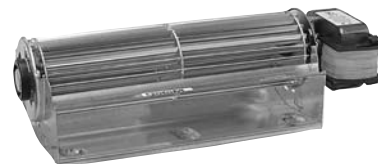
Fig. 14 RB64