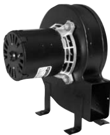
Fig. 7 RB735