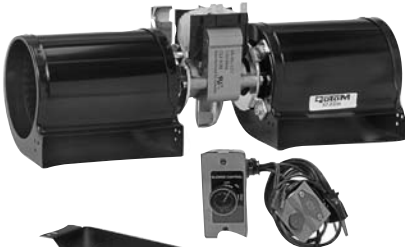
Fig. 4 RB38