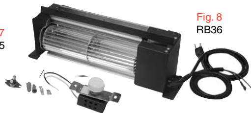
Fig. 8 RB36