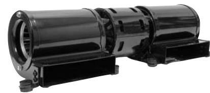
Fig. 6 RB125