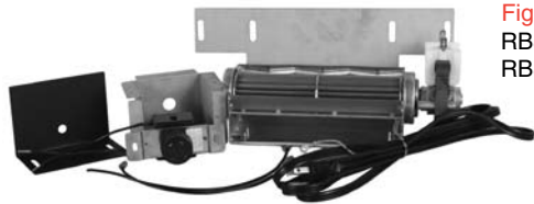
Fig. 1 RB89 RB85