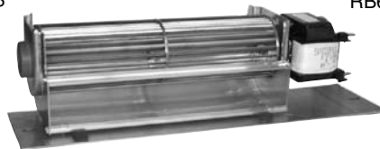
Fig. 5 RB63