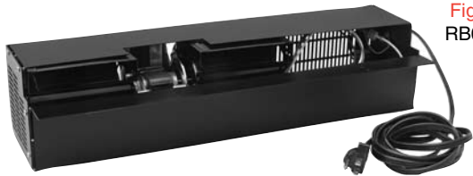
Fig. 10 RB006