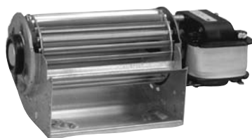
Fig.4 RB66 RB82