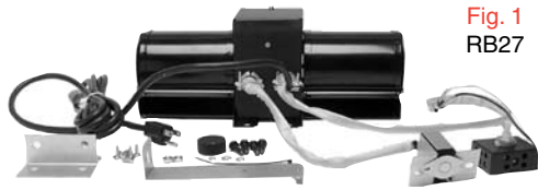
Fig. 1 RB27