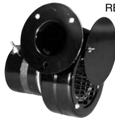
Fig. 8 RB60