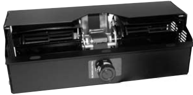
Fig. 5 RB83