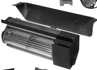
Fig. 7 RB35