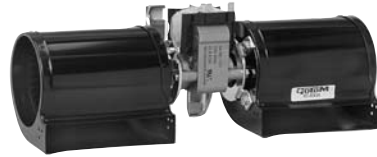
Fig. 2 RB38B