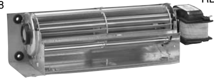
Fig. 12 RB108