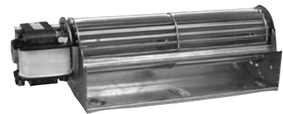
Fig. 9 RB84