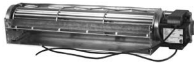
Fig. 2 RB87 RB88