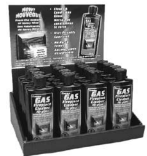
Gas Fireview display merchandiser available upon request.