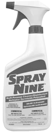
15-26825 739 ml Spray