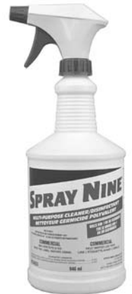
15-26832 946 ml Spray