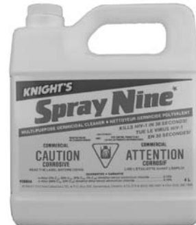
15-26804 4 L Jug