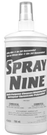
15-26824 700 ml Pump

* Most disinfectant products require a 10 minute contact time to kill germs.